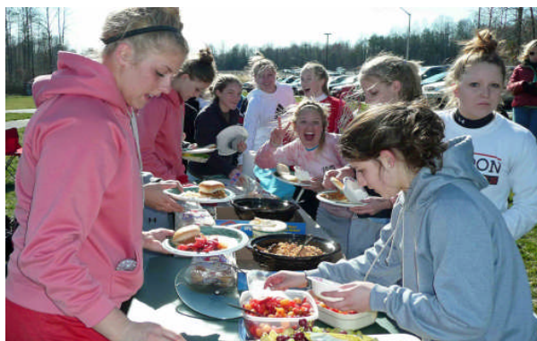
The HHS LAX team enjoys a tailgate party following the George Mason Spring Challenge on March 9 th .